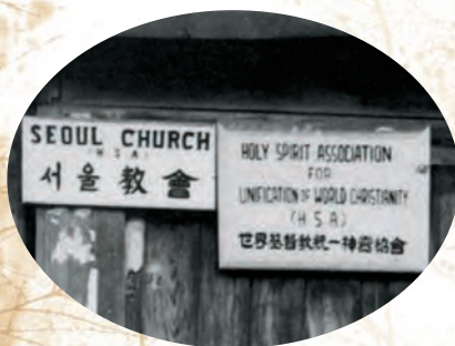
The House of Three Doors entrance; The HSAUWC and Seoul Church (HSA) signs with the English above the Chinese characters; this indicates that our international movement was launched from this hut in 1954.