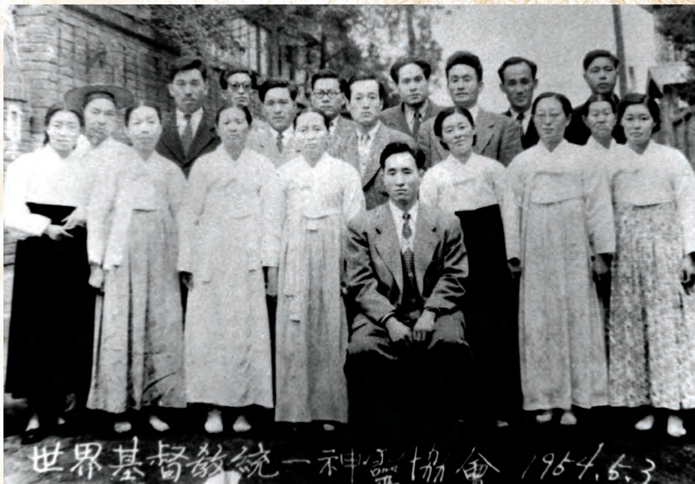
True Father with early members on May 3, 1954, after the ceremony to hang up the sign for the newly established HSAUWC

nice—but on the House of Three Doors in Seoul's Bukhak District.