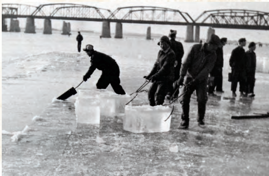
Cutting out Han River ice, January 1954. In those days, men hauled ice ashore for use in summer. It was stored in Seobinggo, a district of Seoul's Yongsan Borough.

We are connected to the Creation, to God's heart as He witnessed the Fall, to the grieving God who had to deal with all the problems of restoration after the Fall from an abyss of deep sorrow. We cannot deny that the Unification Church has inherited the tradition God established through all the ages, while resolving all historical problems, as He worked to make a world in which He is liberated. The Unification Church is a product of history. Unificationism is connected to the countless religions in history, going back beyond Christianity to Adam, the beginning point. Because God could not just leave Adam,