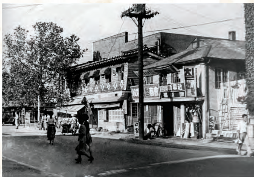
Nakwon-dong in Chongro, central Seoul, in 1954: an image of the South Korean capital in the year HSAUWC was officially incorporated.

I didn't start the Unification Church based on human thinking. Heaven provided the motivation for starting it. If I had established the Unification Church only according to human