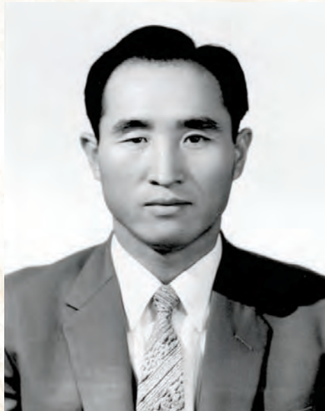
Father in 1954

Accordingly, always keep this symbol in your heart. It also connotes that the person who is living with God's heart has the strength to overcome all of Satan's trials and treacherous forces. Therefore, if you believe and go forward with courage, wherever you go together with this symbol, God will work to support you.